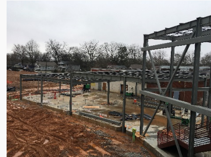
Steel Erection at Kitchen & Lobby