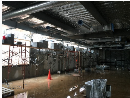
CMU Walls at Retaining Wall