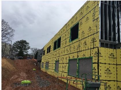
Exterior Sheathing & Air Barrier Prep Work