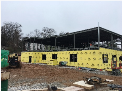
Exterior Sheathing & Framing