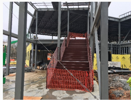
Monumental Stair at Lobby