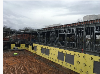
Exterior Sheathing & Framing at Courtyard