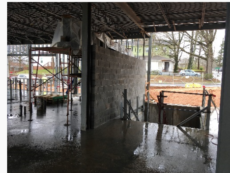
Interior CMU Walls