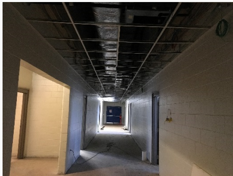
Ceiling Grid and Paint