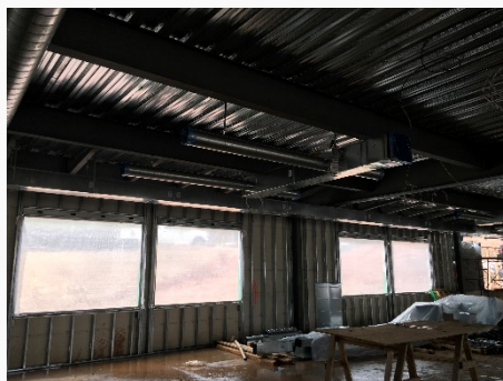
Ductwork at Interior New Building